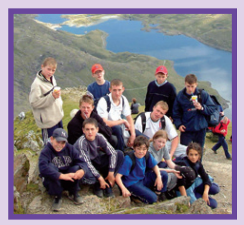
Hill walking has fabulous views