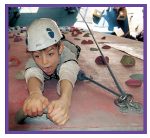
Top roping at in indoor wall

The BMC publishes a climbing wall directory that is free to members, and has a searchable database of walls on the website at bmc.co.uk/map#walls. This will help you locate climbing walls in your area. Notification of forthcoming competitions and other events are also posted on the BMC website under Indoor Climbing and Competitions.