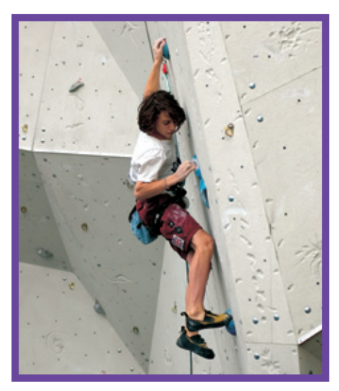
An indoor climbing competition